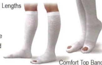
Comfort Top Band